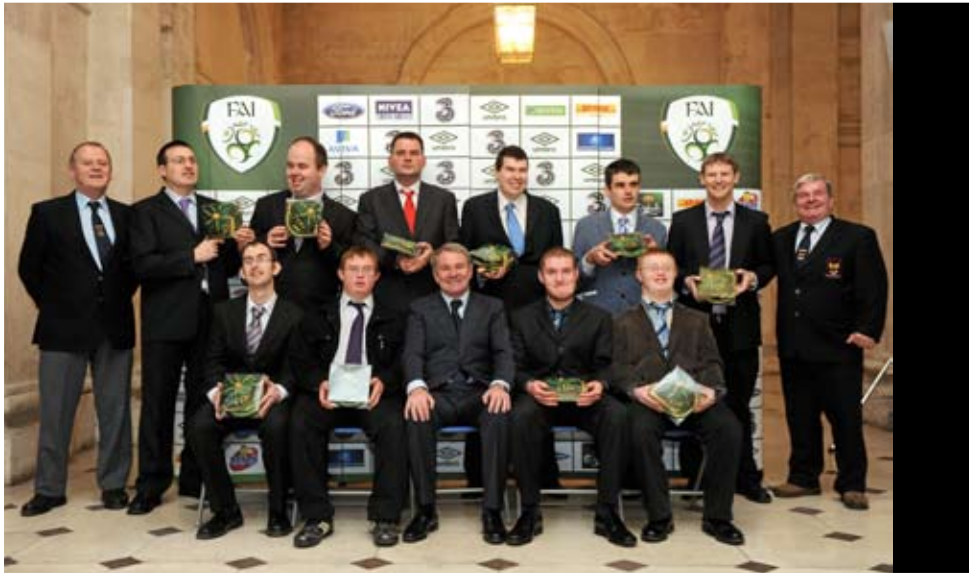
Pictured above are members of the Special Olympics Ireland team who represented Ireland at the 2009 Special Olympics European Football Cup receiving their Football Association of Ireland international caps.

The total number of male and female athletes with international caps in Special Olympics Ireland has now reached 81. This is a fantastic tribute to the athletes and their coaches for their dedication to their sports training and competition.