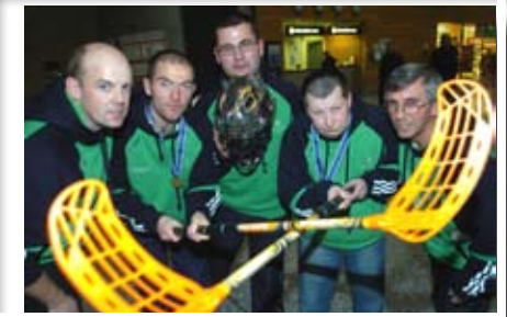
Members of the Special Olympics Ireland Floorball Team who took part in the European Floorball Cup in Austria, September 2010.

Other international news to emerge during 2010 was the decision of Special Olympics International to recognise Floorball as an official sport within the Special Olympics Programme. For several years now, the Munster Programme has offered Poly Hockey as a team sport in their region.