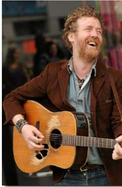
Academy Award winning songwriter Glen Hansard performing on Grafton Street during 2010 Special Olympics Collection Day.

Our new fundraising strategy got underway in 2010 with the recruitment of 5 fundraising coordinators, one to work in each of our 5 regional offices. An online strategy was also developed to enable us to target new audiences and provide information on the overall movement. The new strategy focuses on strengthening our relationships with existing supporters and nurturing new donors and funding providers.