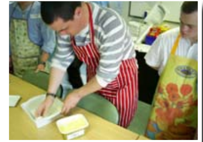
Pictured above are Eastern Region ALPs athletes taking part in a Health Promotion Cookery Workshop in October 2010.